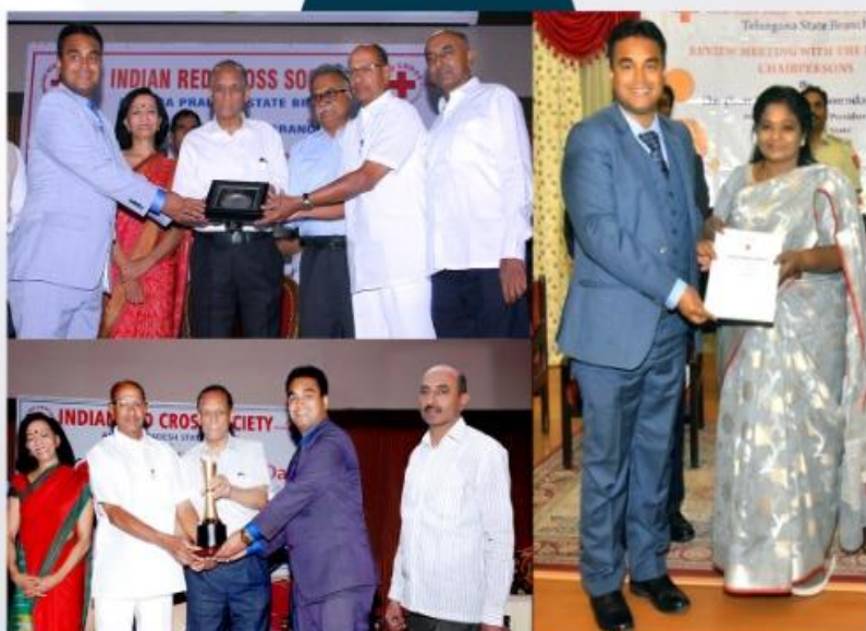
Governor Award (thrice)

International Conference on Recent Innovations in Computer Engineering and Information Technology (ICRICEIT-22) aims to be one of the leading international conferences for presenting novel and fundamental advances in the fields of Recent Innovations in Computer Engineering and Information Technology. It also serves to foster communication among researchers and practitioners working in a wide variety of scientific areas with a common interest in improving Computer Engineering and Information Technology related techniques.